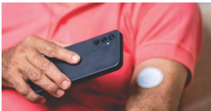
CGM systems provide better diabetic control.

This cooperative effort with CCF is a great example of working together to benefit Calaveras County residents.