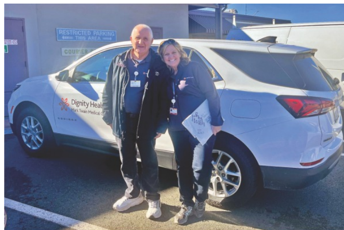
Hospital couriers do their important work with a new SUV.

They are now prepared to meet any challenge in the future — thanks to our generous donors.