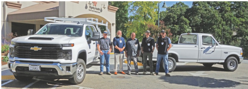
MTMC Plant Operations crew with new and old trucks.

Foundation donors geared up to assure the MTMC Plant Operations Team can hit the road with more confidence in 2024. We have funded replacement of the department’s late-1980s model Ford F250 pickup truck.