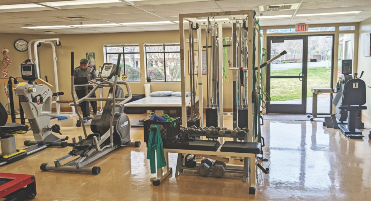
MTMC physical therapy staff is outstanding, and new fundraising to upgrade the equipment will provide state-of-the-art care.

Foundation board members are currently focused on a fundraising strategy to upgrade the Physical Therapy Department at Mark Twain Medical Center.