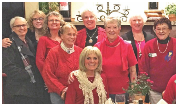
Memories: SICC members celebrate national Go Red For Women movement and their role in the local Take Women to Heart project at Feb. 2016 meeting.

Thank you to SICC and all the residents who have taken advantage of this program over the years!